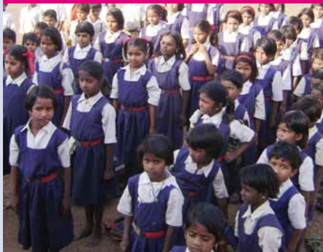
Mott MacDonald undertook a study on status of the alternative schooling and impact on universalisation of elementary education in Rajasthan for Rajasthan Council of Elementary Education.