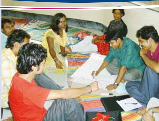
We helped in establishing Project Support Units (PSU) for managing DFID funded HIV/AIDS prevention, treatment and care programmes in the state of West Bengal.

The main purpose of the PSU was to provide management support to SACS for implementing HIV/AIDS programmes including external technical assistance to partner organisations. It also involved building the partners' capacity and assisting SACS with broad base HIV/AIDS prevention and care programmes focused on persons most vulnerable to HIV as part of the developmental programme.