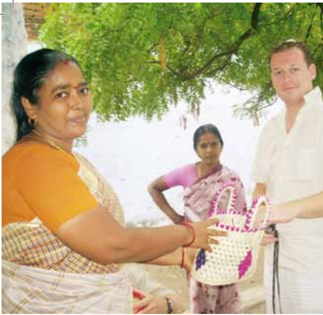
We worked on the UNDP supported cane, bamboo and carpet project in Kerala, one of eleven states that benefited from the programme.