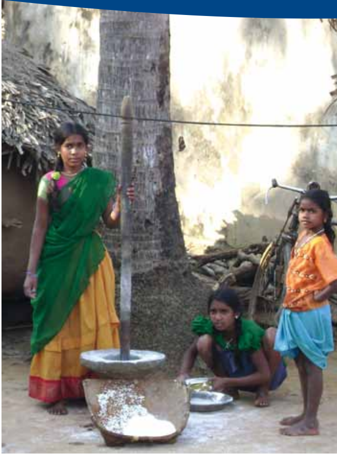
Mott MacDonald managed the DFID funded management advisory support team under Andhra Pradesh urban services for the poor project in managing pro-poor initiatives in 32 class-I towns in the state.