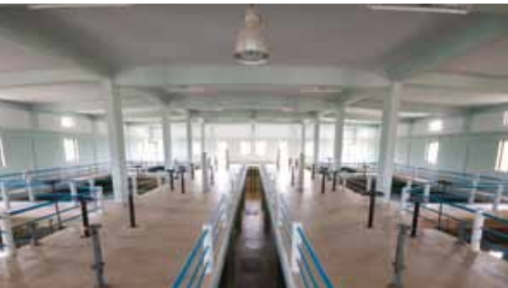
Udipi is one of the five coastal towns in Karnataka where we are improving sanitation and water management for the ADB funded Karnataka urban development and coastal environmental management project.