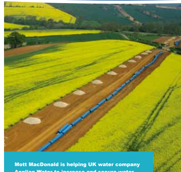
Mott MacDonald is helping UK water company Anglian Water to increase and secure water supplies. At Wing Water Treatment Plant, a 90 million litres per day extension is under construction as well as a 40km pipeline.

Water supply, Karachi, Pakistan Mott MacDonald undertook feasibility studies and preliminary designs for Phase I of the project to cater to the additional 900 MLD water requirement for the Karachi city. The River Indus water is carried from a canal located 45km away from the city. The project included a water treatment plant located at Hub, gravity filters and chlorine disinfection facilities and wash water recovery system and utilities.