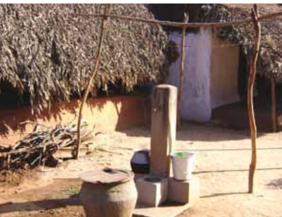
We assessed the financial and economic viability of the World Bank aided rural water supply and environmental sanitation project in the state of Andhra Pradesh.

Water supply, Mysore, Karnataka The ADB funded Karnataka Urban Infrastructure Development Project included a 150MLD water intake structure and pumping station, 50MLD water treatment plant, 12km long and 1100mm diameter transmission main, 11.5ML ground level and elevated service reservoirs and 70km long distribution network to augment the water supply for over 1 million people in the city of Mysore. Mott MacDonald undertook detail design, construction supervision and commissioning assistance for the project.