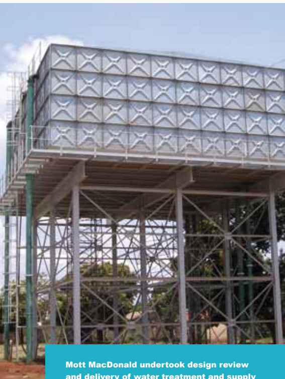
Mott MacDonald undertook design review and delivery of water treatment and supply systems and provision of sewerage, storm water and solid waste management for Ugandan small towns water supply and sanitation project.